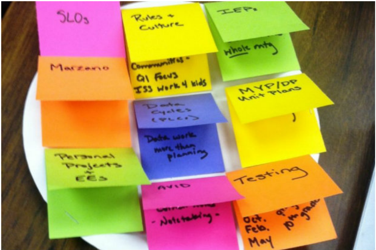
Figure 1: A representative depiction of demands on teacher time.

To represent the demands on teacher time, I took a paper plate and stapled little colorful pieces of paper to the plate. On each piece of paper I wrote a single focus for the year. I meant for this plate to be a creative way to communicate with my department about the many things “on our plate” this year. The plate became a tangible way to discuss threats to morale throughout the year. Each thing on the plate, taken in isolation, is something that could be good for student learning. However, the plate as a whole was so full that each component lost its power. Plus, teachers had little power in choosing what was on the plate, and this lack of autonomy added to overwhelming feelings of discouragement. Morale in my department was crushed by heavy demands on teacher time, coupled with a feeling that teachers’ strengths went unnoticed.