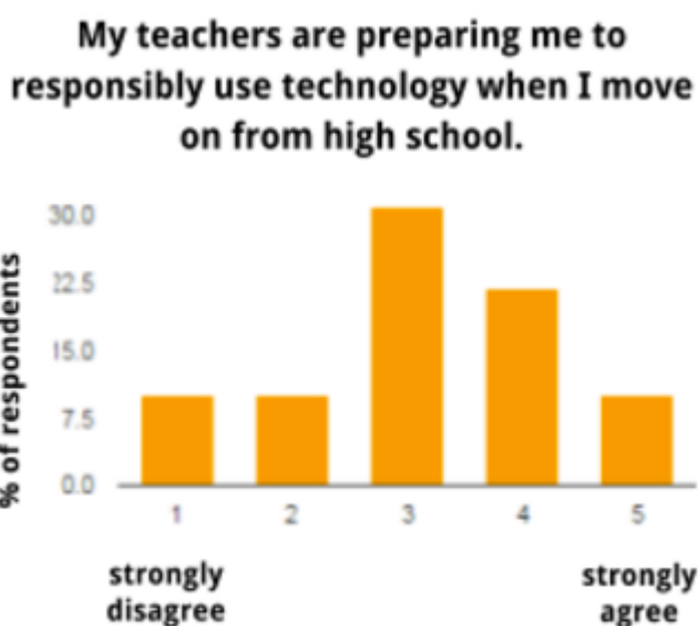
Figure 2: Students don't feel strongly that their teachers are preparing them to responsibly use technology in the future

classroom. Surprisingly, they were quite honest and forthcoming. The vast majority of students recognized that they would need to be able to master appropriate technology use for their future careers (Figure 1), yet did not feel strongly that their teachers were properly preparing them for that inevitability (Figure 2). One student recognized ways in which technology could make his work easier, saying, “Reading from a book requires far more time to find the information you need. With a computer, you can simply type what you need in the search bar and you get all the information that you need.” Other students expressed that they didn’t particularly enjoy working on the computer, especially when it came to reading, saying things like, “I am less distracted when I read actual books.” Students were generally upfront about the computer acting as a distraction to their learning, with 78.4% of students stating that they found themselves distracted by games and social media at least some of the time (Figure 3).