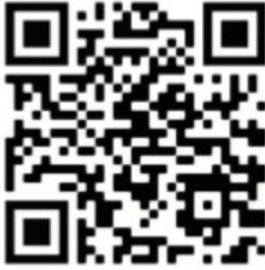
Figure 2. QR code for Physics 4 All: Labs for PhET Simulations

Of course, the journey is not over; after all, a book doesn't sell itself. Now, I am off to conferences, thanks again to the generosity of the Knowles Teacher Initiative. I am happy to report that as of March, interest in my book has grown both through Amazon and on Teachers Pay Teachers. I hope the story of my experience encourages other teacher-authorpreneurs to pursue their own writing and publishing goals. Take a weekend, even a personal day, to map out the steps you need to take and reach out to your own professional community for support. Will it be easy? No. But will it be worth it? Yes.